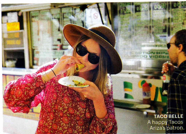
TACO BELLE A happy Tacos Ariza's patron.

Can't get to the tropics this winter? Pretend with a Frieda&Nellie necklace inspired by the designers' travels. This one evokes Puerto Escondido, Mexico, where they surfed and trawled markets for vintage gems ( friedaandnellie.com ; $525).