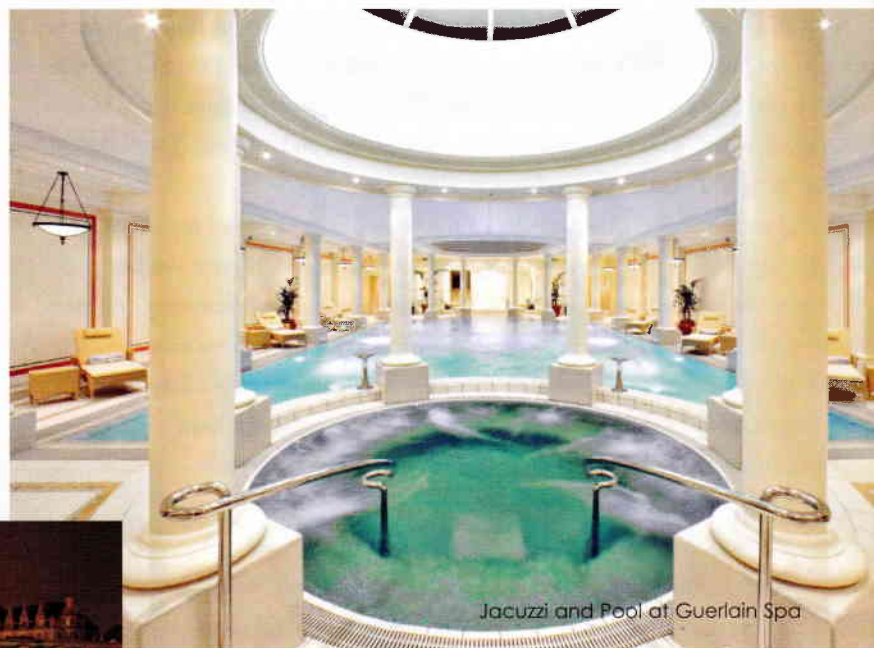
Jacuzzi and Pool at Guerlain Spa