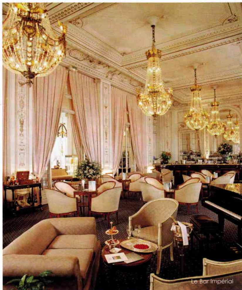
Le Bar Impérial

Hôtel du Palais, hotel-du-palais.com ; 001.33.(0) 5.59.41.6400