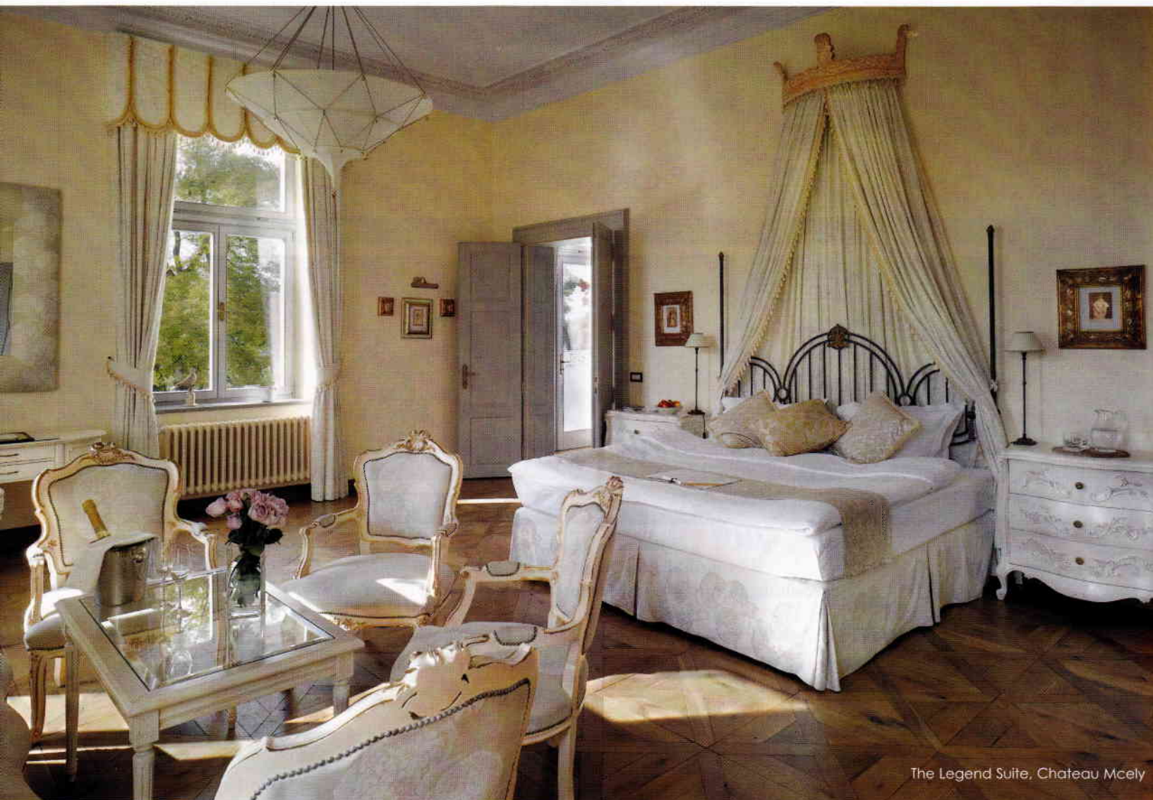
The Legend Suite, Chateau Mcely